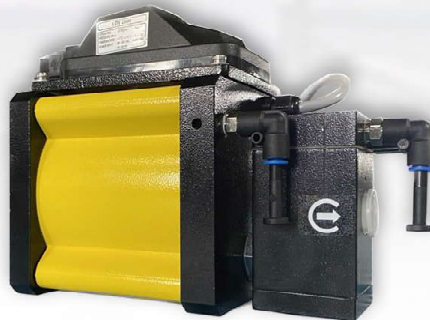
LDV 2000 V2