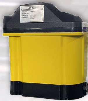
LDV 1000 V2