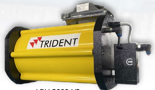
LDV 3000 V2